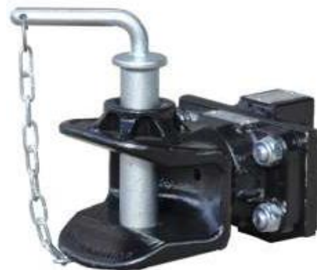
3-Point Hitch Towbar Cat. 2