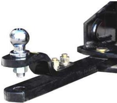
3-Point Hitch Towbar Cat. 1