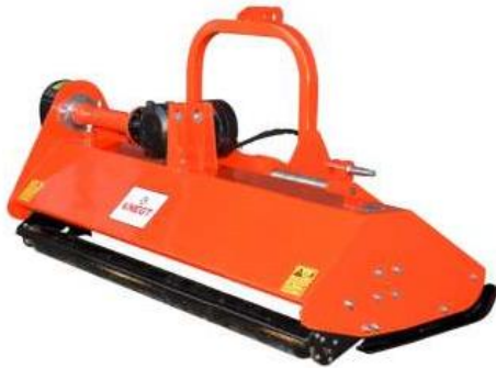
Verge Flail Mower HD (140HD, 160HD, 180HD)